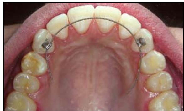
Fig. 3 Retainer wire passed through both MPAs.