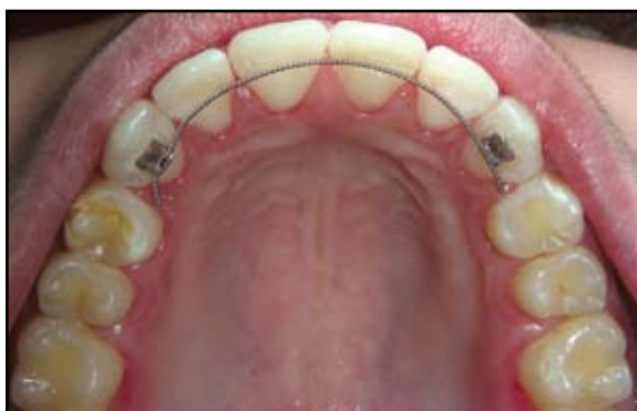
Fig. 4 Retainer wire passively adapted to incisors and cut distal to canines.

The MPA is useful in many clinical situations where it may be difficult to bond a bracket or tube to avoid patient discomfort from occlusal interference or trauma to the oral tissues. The attachment comes with a flat or curved base and can be bonded with the lumen either to the gingival or the occlusal, depending on the situation. We have used the MPA in cases of severe crowding, rotations, deep bite, crossbite, scissor bite, and impacted and tipped second molars, and for bond-