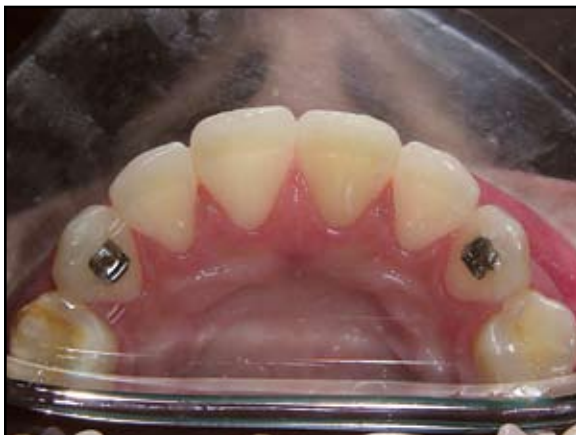
Fig. 2 MPAs bonded to canines with lumens on gingival sides.